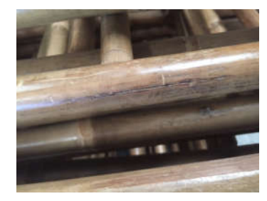
small natural defect on bamboo